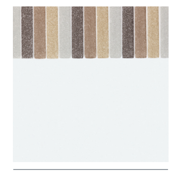
Beige Stripe Border