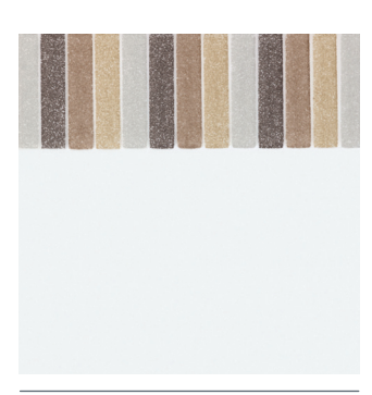
Beige Stripe Border