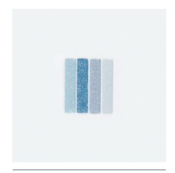
Blue Stripe Inset