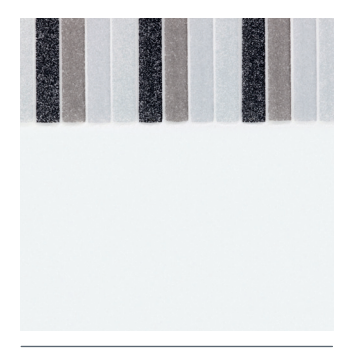
Grey Stripe Border