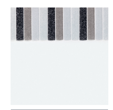
Grey Stripe Border