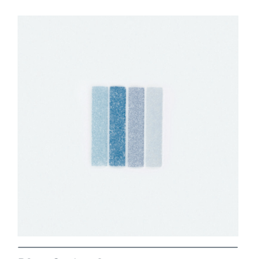
Blue Stripe Inset