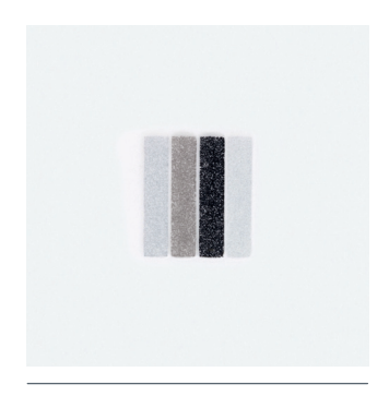
Grey Stripe Inset