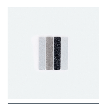
Grey Stripe Inset