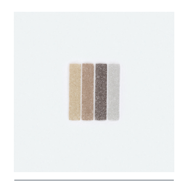
Beige Stripe Inset