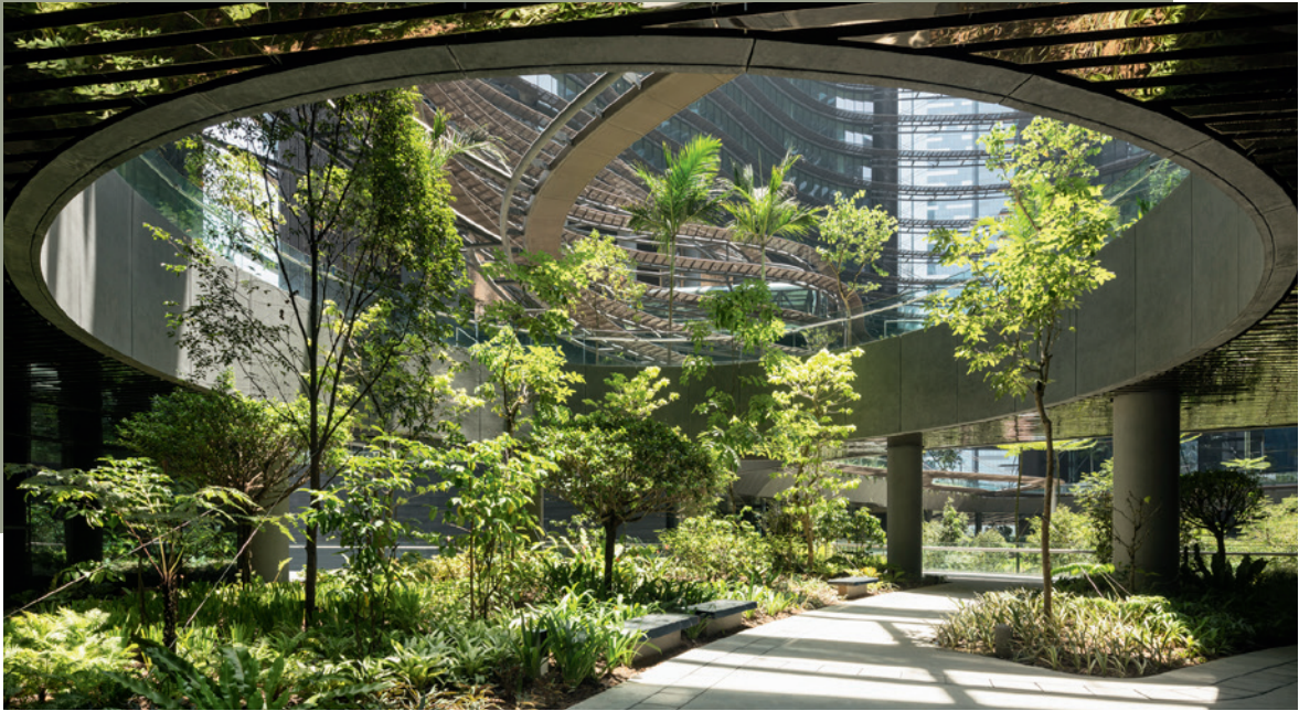
Marina One Singapore, KEIM Concretal-Lasur; on the left: Alnatura Campus Darmstadt, Germany, KEIM Lignosil-Inco

KEIM has always been a pioneer when it comes to sustainability and takes the lead in the construction industry with the certification of 65 products in 4 product groups. This accounts for more than 80 % of KEIM's paint sales. All products received the Cradle to Cradle Certified® certificate in silver. During certification, the products and processes were assessed in the following 5 categories.