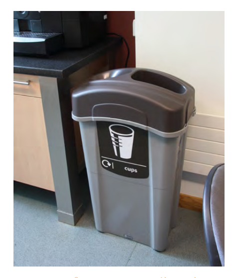
Eco Nexus® 85 Cup Recycling Bin

A compact and cost-effective solution which is ideal for office environments. It is specially designed to collect used cups and waste liquid in a separate reservoir.