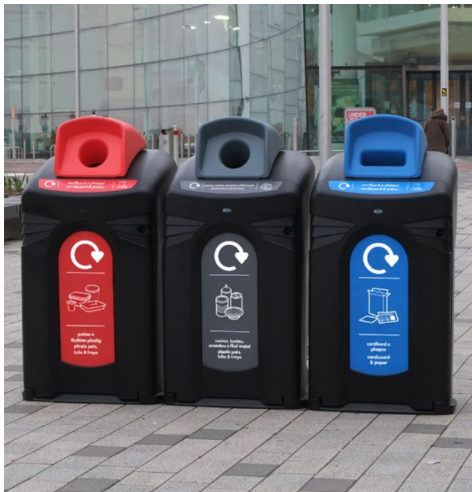
Nexus® City 140 Recycling Bin