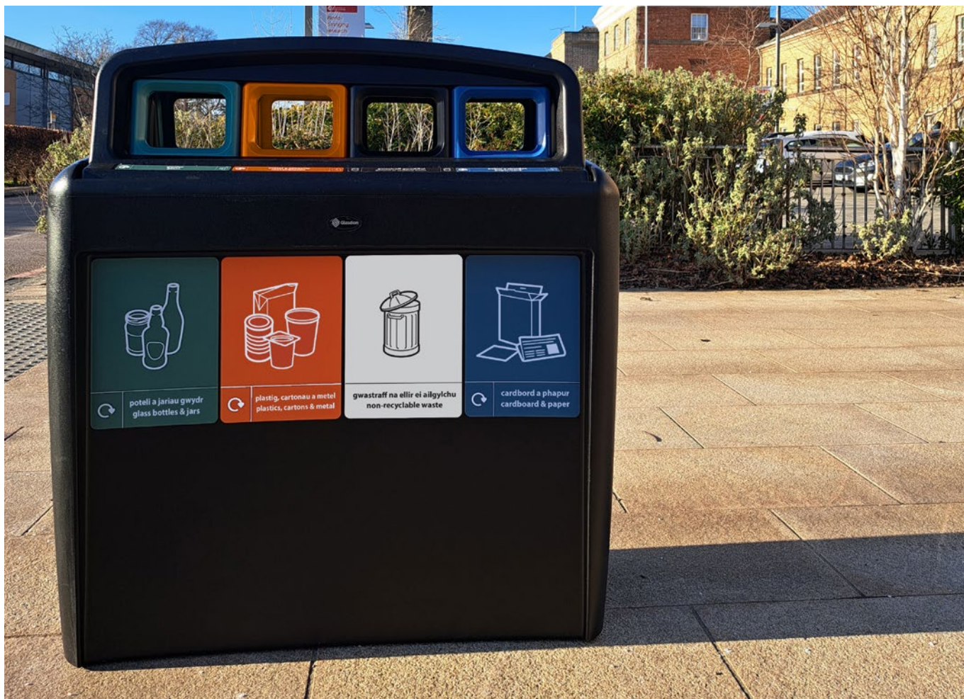
Nexus® Evolution City Quad Recycling Station