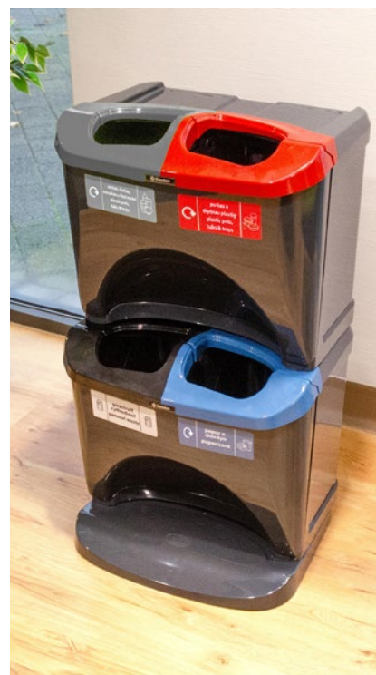
Nexus® Stack Recycling Bin

Maximise the functionality of your office by utilising our collection of indoor recycling containers, designed to create an attractive recycling station. These containers serve as a great tool for boosting recycling rates and minimising contamination within your company.