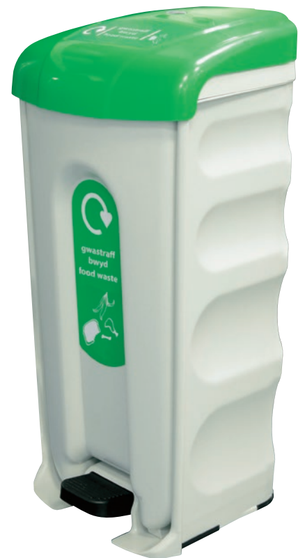
Nexus® Shuttle Food Waste Bin

To address outdoor food waste, consider the Combo™ Waste Bin. This large apertured container can collect up to 140 litres (59.5kg) of waste, whilst its robust and durable design ensures it can withstand extreme temperatures and various weather conditions.