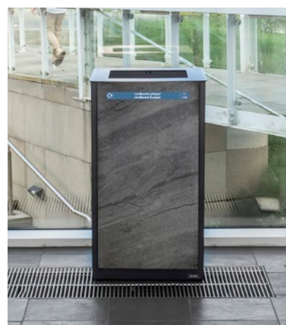
Nexus® Style Recycling Station