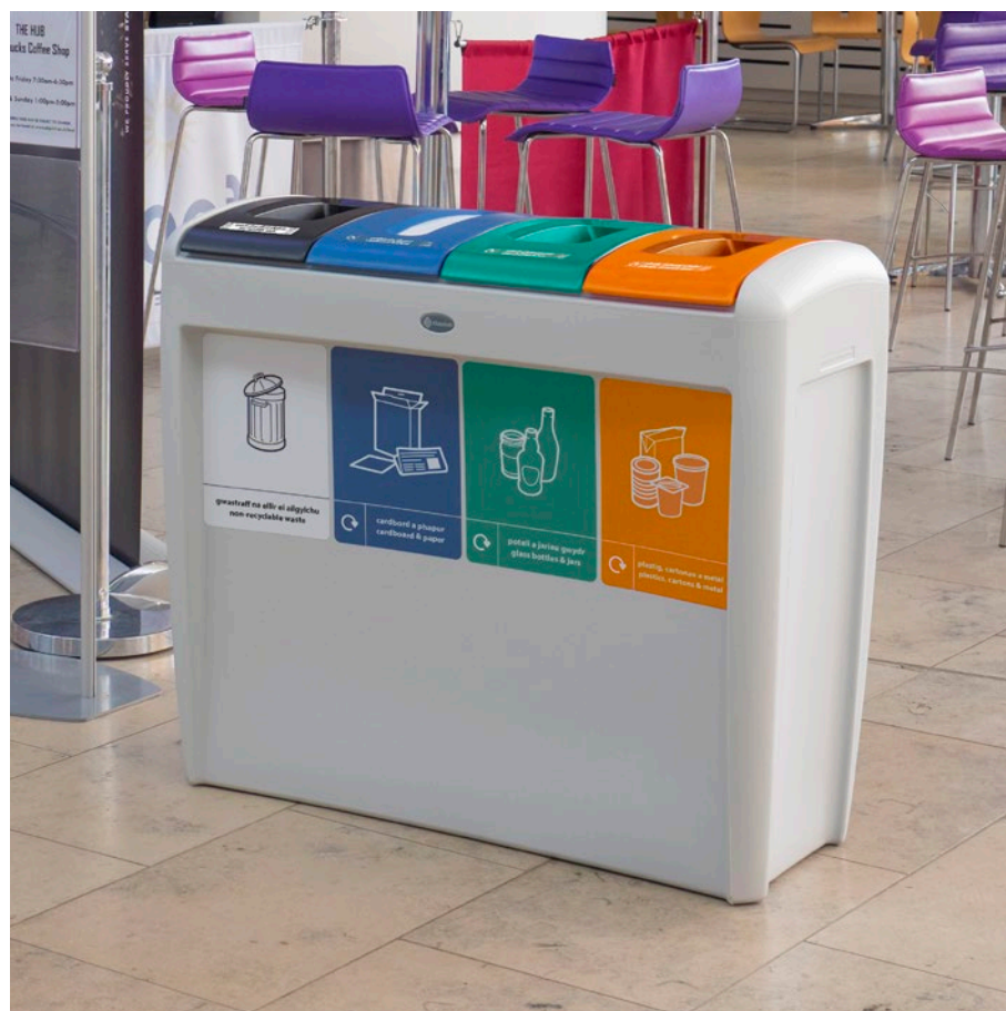
Nexus® Evolution Quad Recycling Station