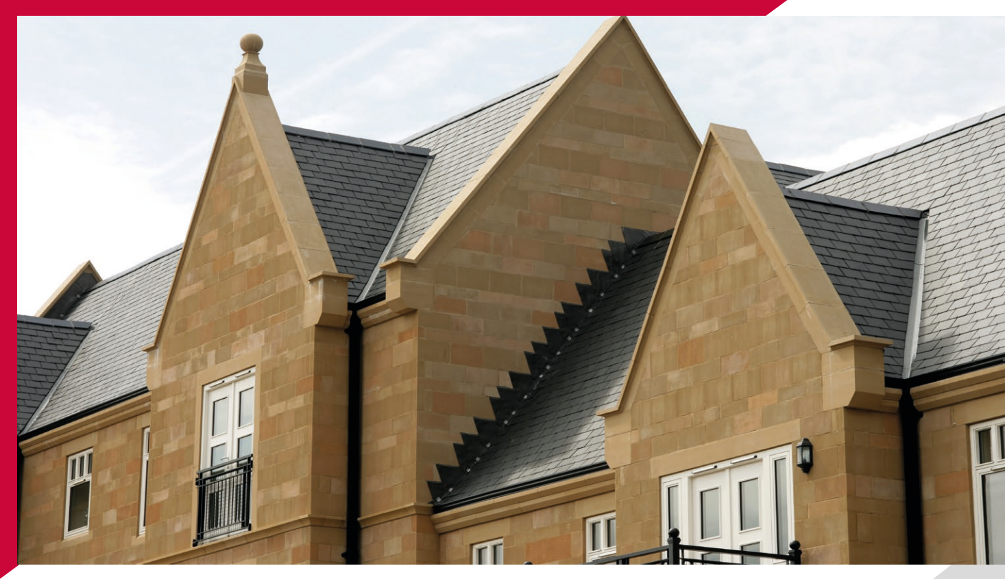
St Elphin's Park Retirement Village, Robinson Court, Darley Dale, Matlock, supplied using three colours of Regency Textured Ashlar.