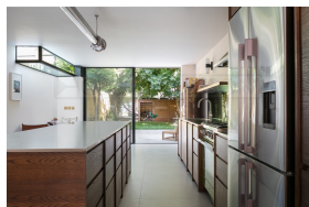
Stainless steel island