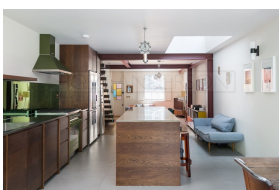
Stainless steel worktop