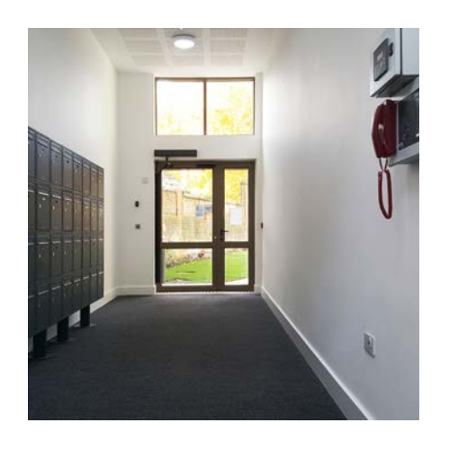
PRINT Custom artwork