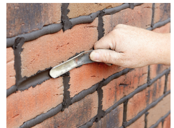
4. Mortar is tooled in the manner of traditional pointing.