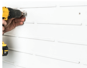
1. The ribbed backing panel is fixed to the substrate. (Fixings vary according to substrate.)

NB. Additional detail diagrams are available on our website or please refer to our Installation Instructions. Please note that Eurobrick cladding systems must be installed in accordance with the Installation Instructions.