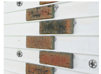
2. Brick slips are attached with permanent bonding adhesive.