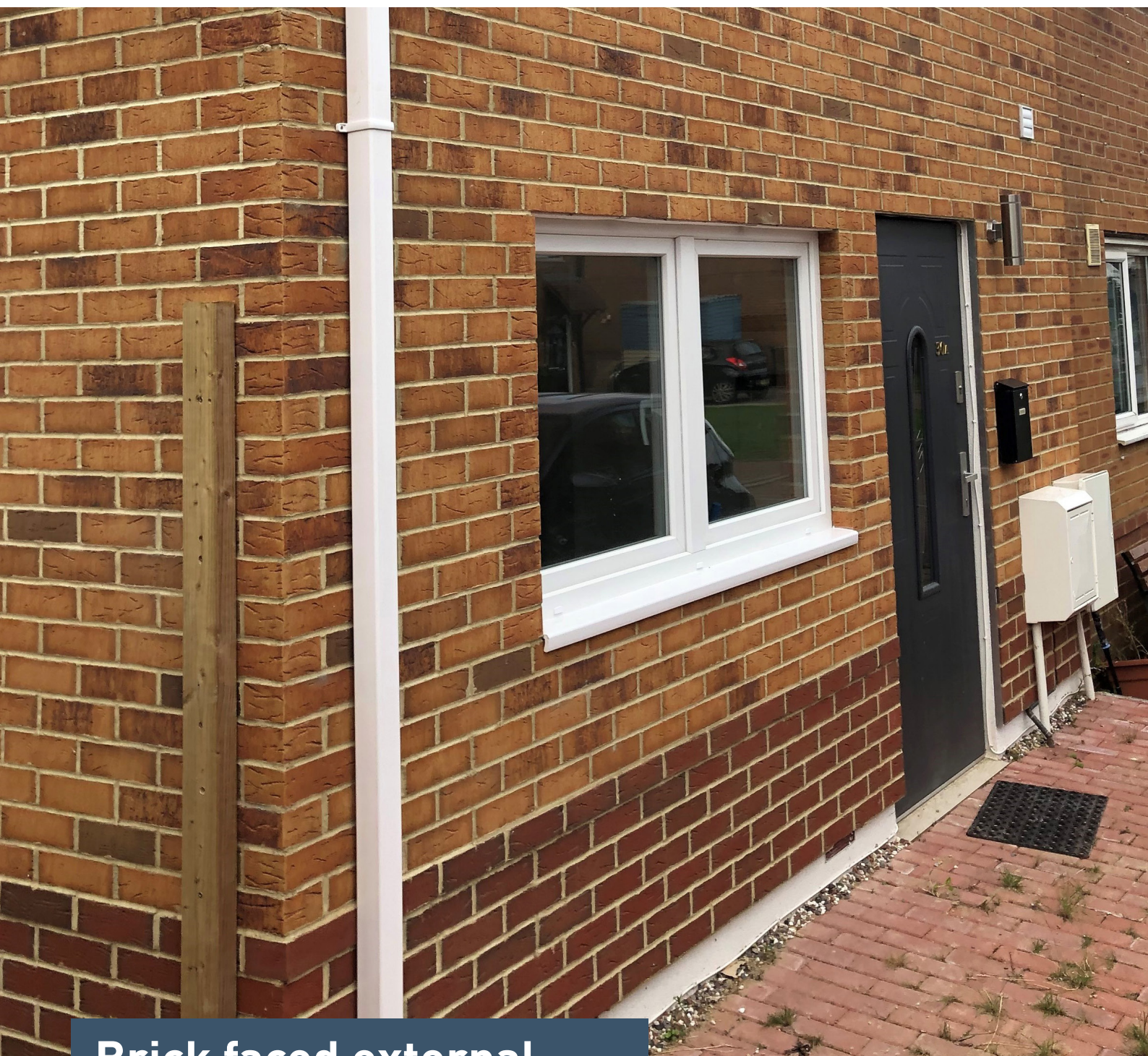
Brick faced external wall cladding