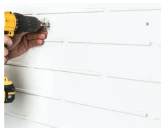
1. The ribbed backing panel is fixed to the substrate.

NB. Additional detail diagrams are available on our website or please refer to our Installation Instructions. Please note that failure to fix in accordance with Eurobrick's instructions will invalidate the product guarantee.