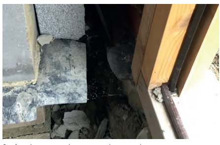
Site form barriers amalgamating with structural openings are commonly poorly executed, of questionable gas resistance and permit damp permeation.