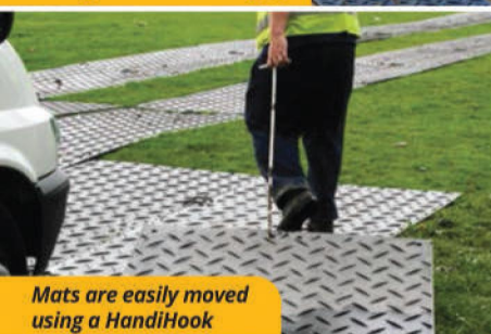
Mats are easily moved using a HandiHook