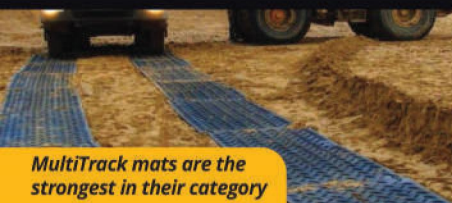
MultiTrack mats are the strongest in their category