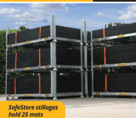
SafeStore stillages hold 25 mats

Overall Size: 2435 x 1215 x 13mm (plus treads)