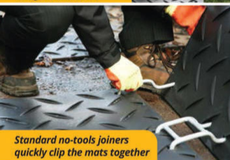
Standard no-tools joiners quickly clip the mats together