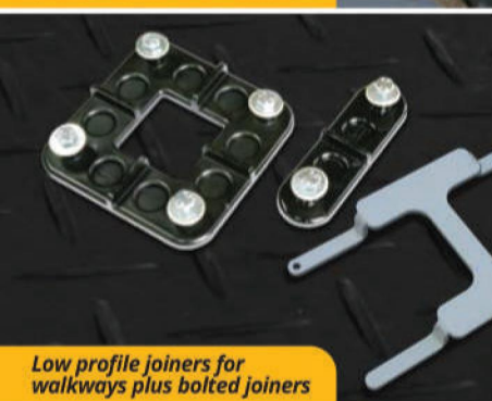
Low profile joiners for walkways plus bolted joiners