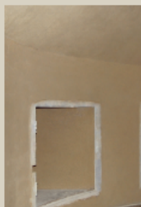
Decorative coating - Entreprise Intérieur Chanvre (71).