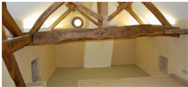
Decorative coating - Entreprise Intérieur Chanvre (71).