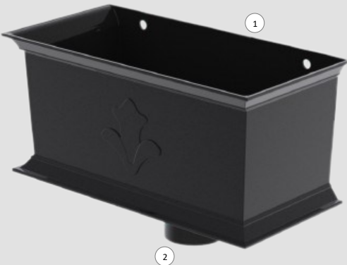
1 - Large Hopper 2 - Outlet

Seamless Aluminum Group Hoppers are designed and manufactured to provide the essential architectural features appropriate to any building. Our Aluminium Hopper’s are available in a range of shapes and sizes and are most manufactured on site in Ballyshannon, Co Donegal in marine grade Aluminium to ensure its high quality. As we manufacture our pressed hoppers and accessories in our state of the art manufacturing plant we can accommodate any special requirements you may have in relation to size, colour, special shape, outlet etc.