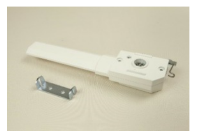
Chain Window Opener