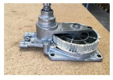
Maxi Operator Gearbox