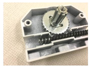
Spring Stop Preventing The Cable From Coming Out Of The Chain

Or drop us an email with any questions to <u>sales@rocburn.com</u>