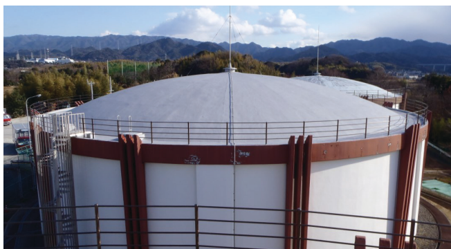
Intercrete 4885 is compatible with flat, pitched and curved roofs

Problem: Existing roof degradation due to the aggressive effects of weathering. Complex detailing requirements mean that specifying effective waterproofing can be particularly challenging.