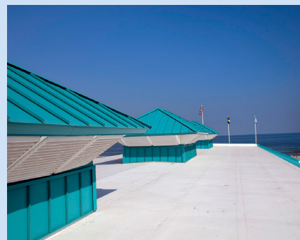
Intercrete 4885 is a waterproofing membrane that is ideal for use in a variety of roofing systems