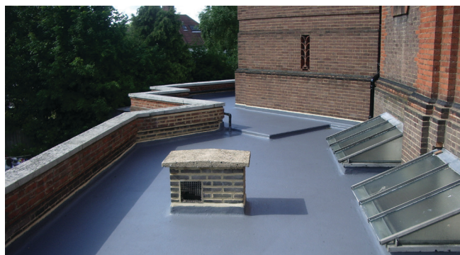
Intercrete 4885 is a single pack product, meaning no complex mixing on site

Problem: Ponded water on roofs can be a breeding ground for microorganisms and other bacteria. This can be particularly problematic where the roof is protecting a sensitive environment such as a hospital or school.