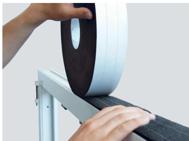
Installation example: ISO-BLOCO HYBRATEC

* Movement in structural elements and temporary longitude changes are to be taken into account by the max. joint width.