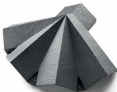
5-way ridge top cap ERS 1326GY2 (25°) Also available in: 15° (ERS 1330GY2) 20° (ERS 1331GY2) 30° (ERS 1332GY2) 35° (ERS 1333GY2)