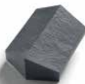
Victorian hip end cap ERS 1329GY2-FG