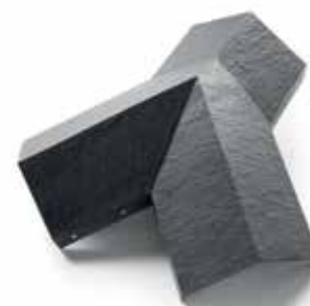
3-way ridge top cap ERS 1322GY2 (25°) Also available in: 15° (ERS 1334GY2) 20° (ERS 1335GY2) 30° (ERS 1336GY2) 35° (ERS 1337GY2)