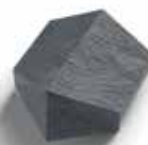
Edwardian hip end cap ERS 1325GY2-FG