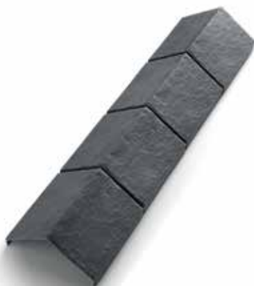
Ridge/hip length cap (6m) ERS 1321GY2-FG