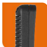
Curved slim design.