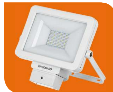
LEDPRO20WH Floodlight shown with LEDPROPCWH Plug & Play Photocell option.

Simply plugs into the terminal box offering a 140W LED PIR and Photocell option. One size fits all floodlights.