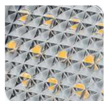
Polycarbonate front lens with prismatic centre for enhanced light control.