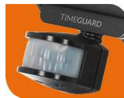
Plug & Play Options (sold separately)