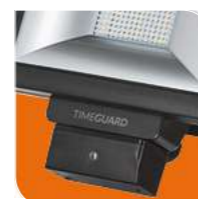
Plug & Play Photocell option with linkable control (sold separately).