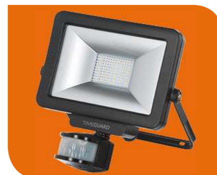
LEDPRO20B Floodlight shown with LEDPROSLB Plug & Play PIR option.