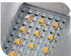
Prismatic LED Lens

The new Night Eye Plus range of LED Floodlights with Plug & Play PIRs and Photocells for instant safety and lighting control