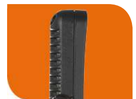
Curved Slim Design