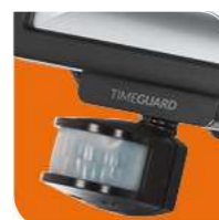
Plug & Play PIR option with linkable control (sold separately).