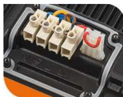
Easy Access Terminals