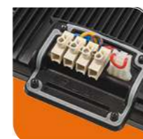
Simple and quick to fit terminal block connection.