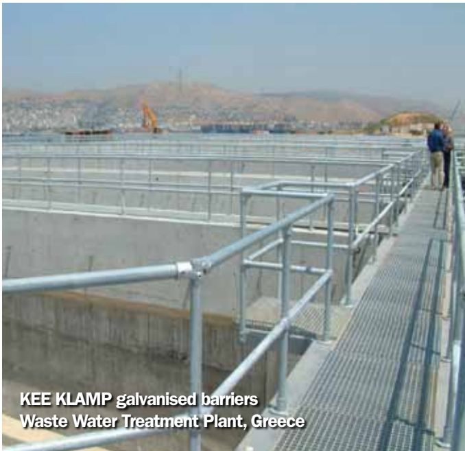
KEE KLAMP galvanised barriers Waste Water Treatment Plant, Greece