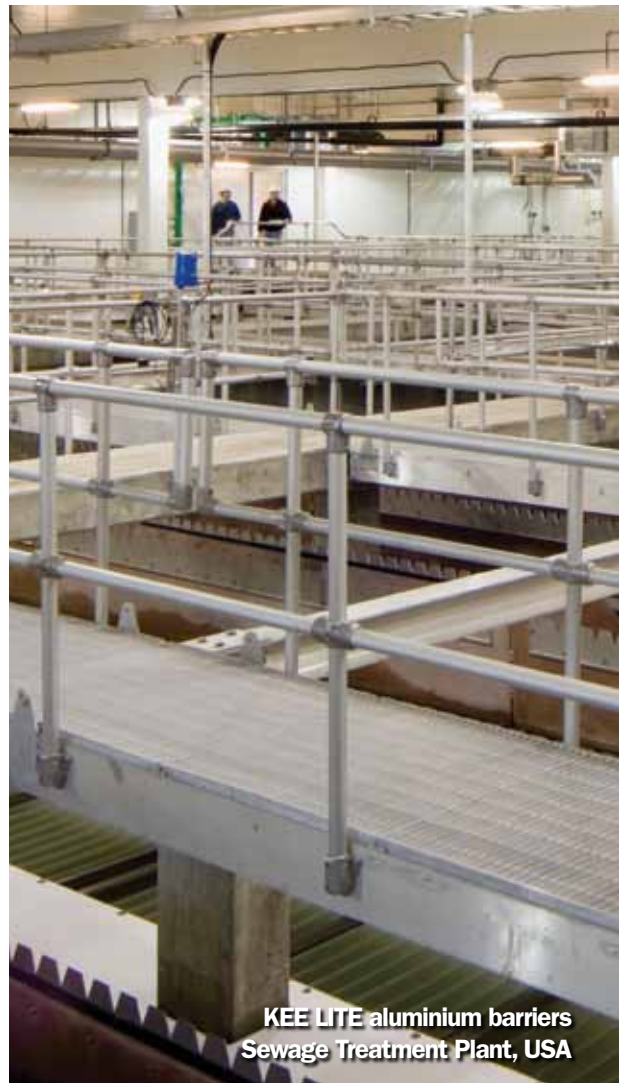
KEE LITE aluminium barriers Sewage Treatment Plant, USA

Slip-on fittings securely join standard sizes of structural tube into almost any configuration imaginable, utilising the widest range of fittings available on the market today.