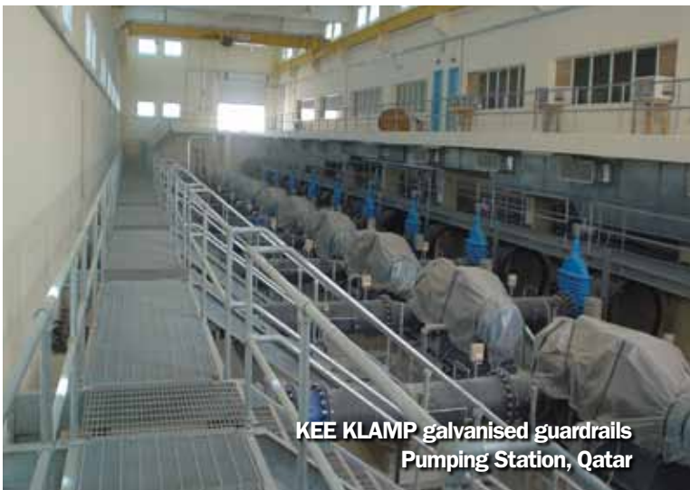
KEE KLAMP galvanised guardrails Pumping Station, Qatar