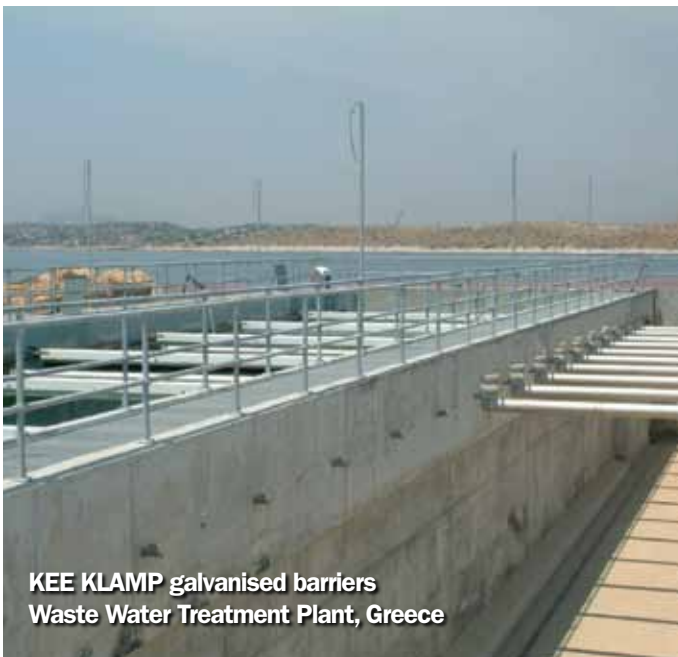
KEE KLAMP galvanised barriers Waste Water Treatment Plant, Greece

The perfect showcase for the versatility of Kee Safety's barrier systems is the Psyttalia Waste Water Treatment Plant – Europe's biggest sewerage plant and one of the largest internationally.