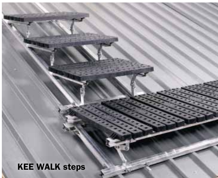
KEE WALK steps

Kee Safety provides pre-assembled step configurations in 3m or 1.5m lengths which require only minor adjustment on-site. The rotating arms (shown above) allow the installer to set the angle of the steps simply by removing the locating bolt, setting the horizontal angle and then replacing the bolt. The steps configurations will change depending on the pitch of the roof. Standard components are available for 5° - 10°, 10° - 15°, 15° - 25°, 25° - 35°, all which comply with the requirements of EN 516. Kee Safety can provide specific information on all the different step configurations as required.