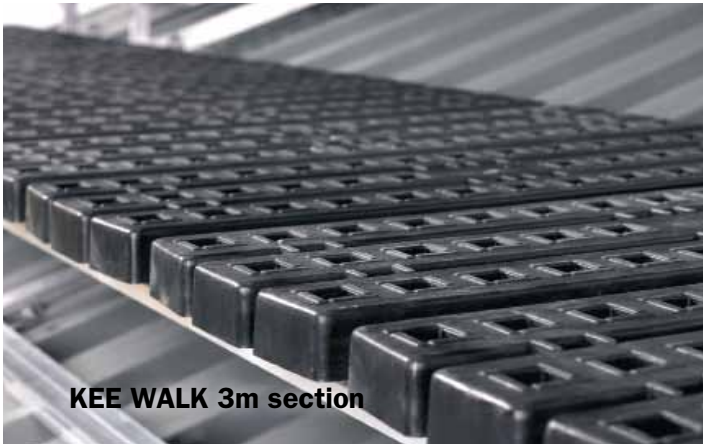
KEE WALK 3m section

KEE WALK provides a flexible, easy to assemble walkway system designed for use on most modern roof types. To demonstrate the flexibility of the system, a brief explanation of the key constituent parts; the longitudinal configuration, the configuration to traverse a roof, the step configuration and the treads is given below. The anti-slip characteristics of the walkway are essential for user safety. The British Standard (BS 4592) requires a minimum co-efficient of 0.4 as a measure of the friction and KEE WALK achieves almost double this in both wet and dry conditions. Specific fixing packs are supplied for the different roof types.