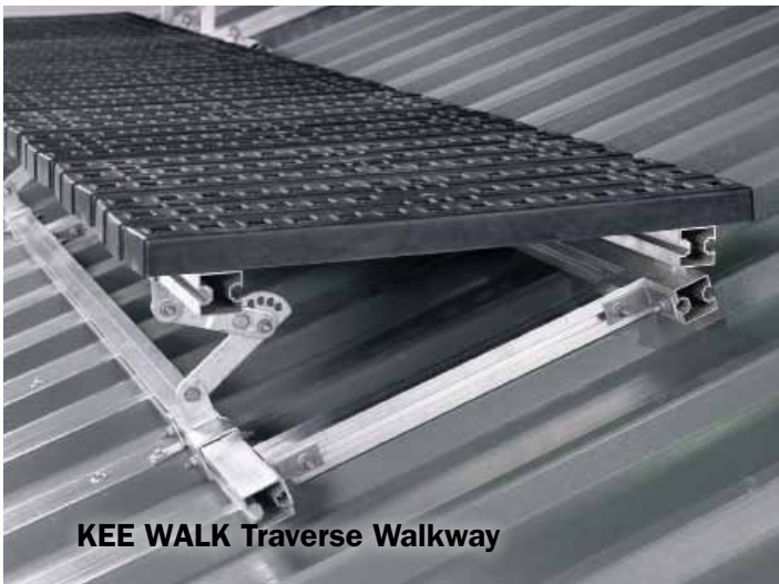
KEE WALK Traverse Walkway

Supplied pre-assembled by Kee Safety to facilitate rapid on-site installation and thus minimise installation costs, these standard lengths have 12 treads per 3m. Weighing only 24kg, the standard lengths are easily positioned and aligned. They are joined together by a simple 100mm long straight connector which attaches to the bearer bars.