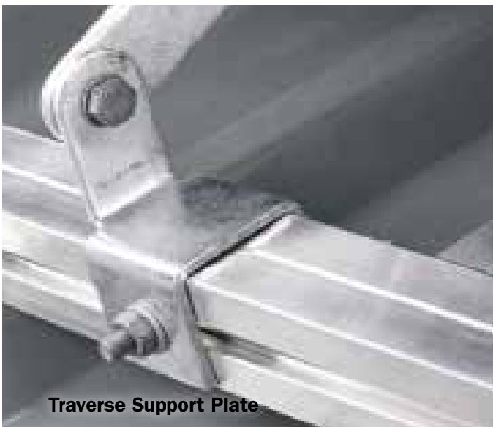
Traverse Support Plate

KEE WALK is designed to make the task of building a walkway across a sloping roof a straight forward installation, again using a standard set of components. A traverse section of walkway uses a standard KEE WALK section for the level walking surface which is mounted onto a sub-frame fixed to the roof. The two sections are joined with hinged brackets at the rear of the assembly and use the rotating arms at the front to level the walking surface, as depicted on the adjacent photograph.