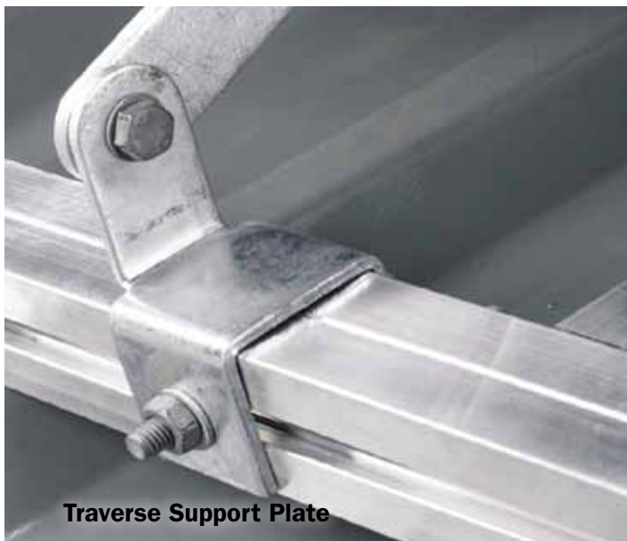
Traverse Support Plate

KEE WALK is designed to make the task of building a walkway across a sloping roof a straight forward installation, again using a standard set of components. A traverse section of walkway uses a standard KEE WALK section for the level walking surface which is mounted onto a sub-frame fixed to the roof. The two sections are joined with hinged brackets at the rear of the assembly and use the rotating arms at the front to level the walking surface, as depicted on the adjacent photograph.