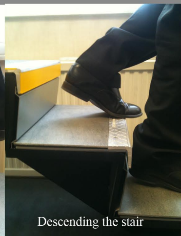
Descending the stair