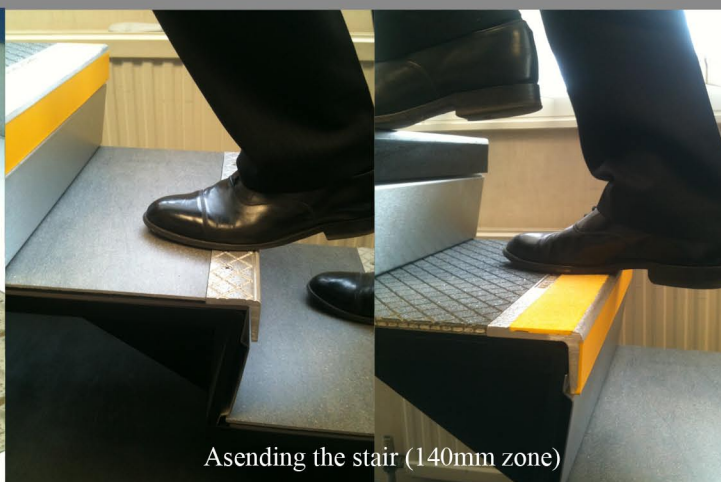
Ascending the stair (140mm zone)