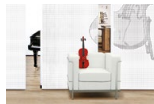
DORMAcoustic for good room acoustics

Here: a slow fox-trot for beginners; through there: salsa for improvers – all happening at the same time. And in the evenings, maybe a disco or prom with the whole floor opened up – all typical events encountered in the modern dance school wishing to offer its attendees a broad program with a variety of regular highlights and experiences. The intelligently designed movable wall systems from DORMA Hüppe make it easier for you to respond flexibly to the changing spatial requirements that result from offering such choice.