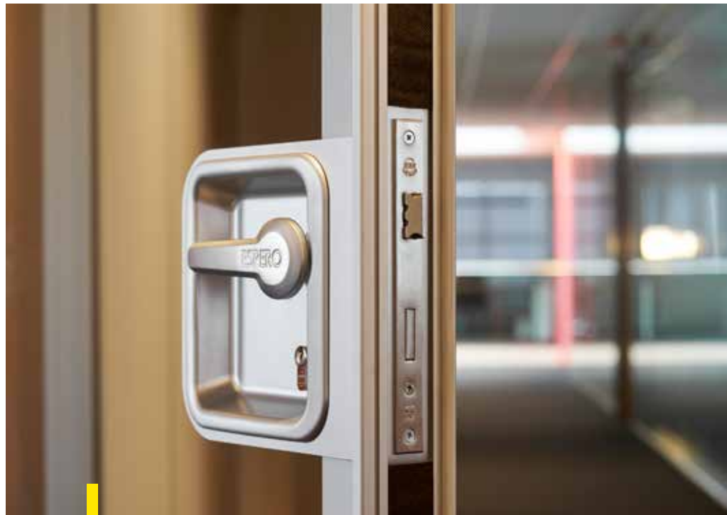
Westerbork Rabobank branch, detail of the Lumio.