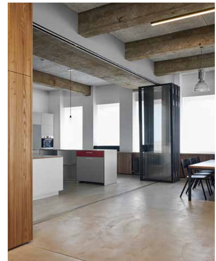
Stramien Architects, Antwerp, Belgium The Lumio wall is easy to open and close thanks to the hinges.