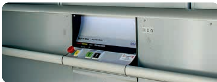
Robust and elegant control panel

To facilitate access, it is also possible to equip the Cibes A8000 with automatic door openers and large, remote call buttons, also known as elbow buttons.