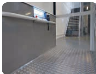
Aluminium chequer plate