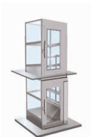
1. Single entry