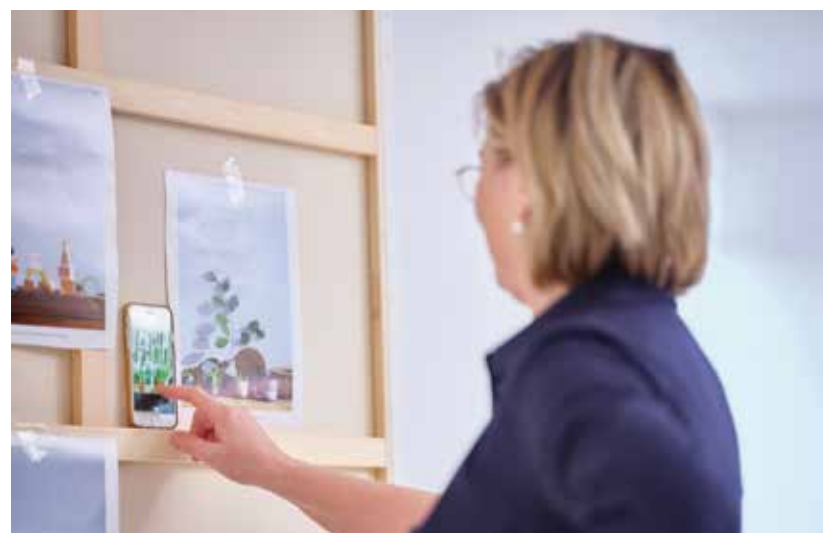
Above: our experts consider the trends that will influence the Dulux Trade colours for 2022