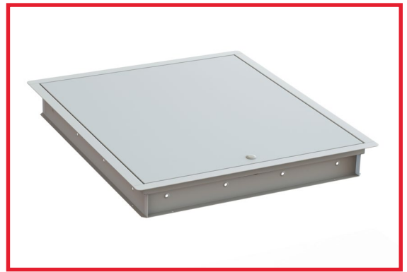
Z-Series Metal Fire Rated Loft Door

High performance metal loft access doors with 1 hour fire protection