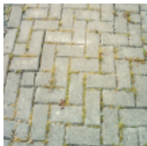
No more weeds