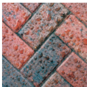
Maintain your investment