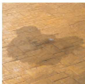
Stop oil stains