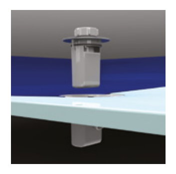
Typical waste connection (Bath to Tuff Form® and below)