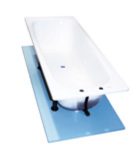
Bath legs can be situated directly on top of the Tuff Form®