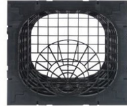
Control End Plate