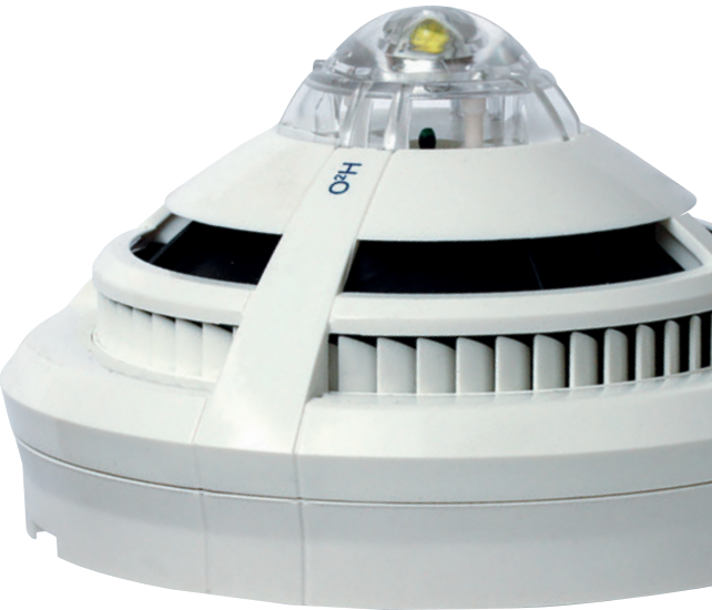
*with correct interfacing and specification

The SAFE solution is fully configurable through Honeywell Gent’s configuration tool, allowing you to specify the times of delay pre or post button activation, depending on your requirements and risk assessment.