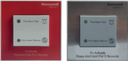
Red and silver options available.