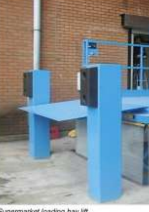
Supermarket leading bay lift

Gates if fitted have safety interlocks to prevent opening unless the platform is at the correct level.