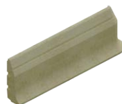
Outside corner R