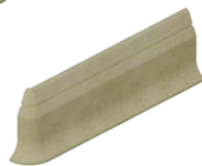
Outside corner L