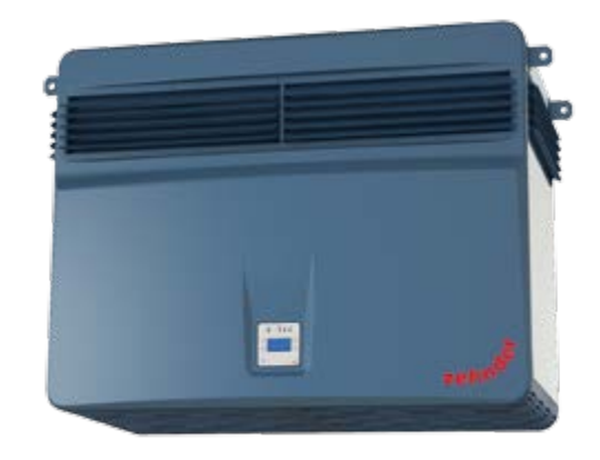
Zehnder CleanAir 6