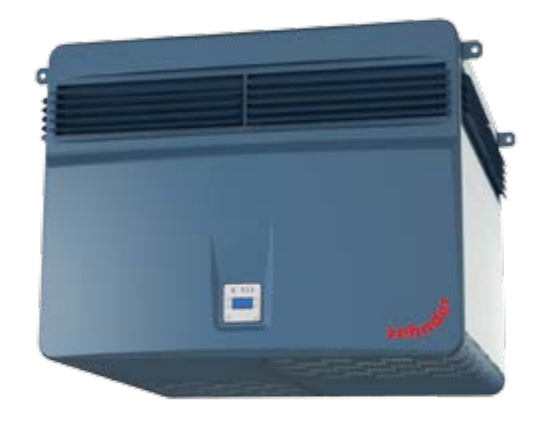
Zehnder CleanAir 12