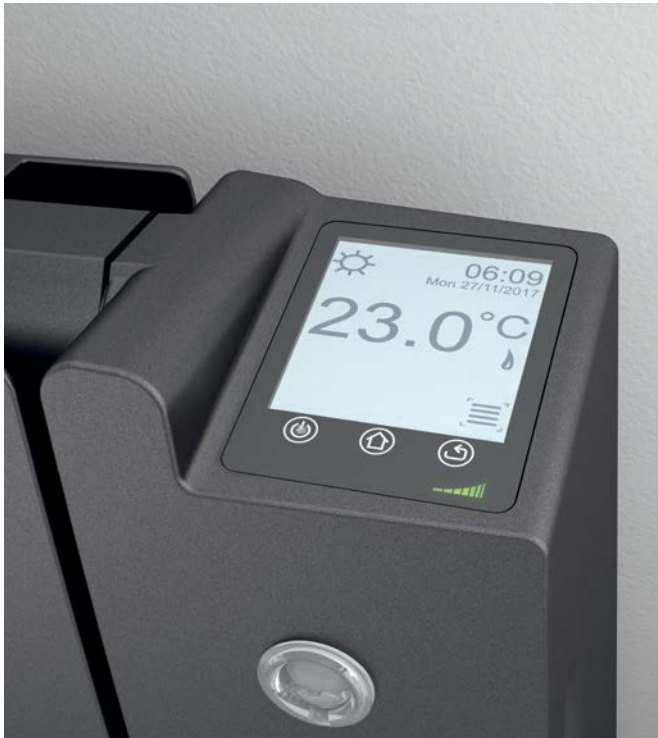
Remote control device with "open-window-detection"

V20210614, RAD_DAS, UK_en, subject to change without notice