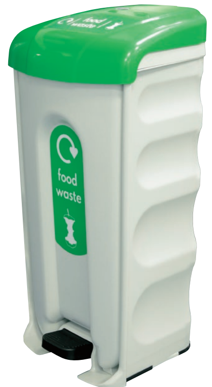
Nexus® Shuttle Food Waste Bin

To address outdoor food waste, consider the Combo™ Waste Bin. This large apertured container can collect up to 140 litres (59.5kg) of waste, whilst its robust and durable design ensures it can withstand extreme temperatures and various weather conditions.