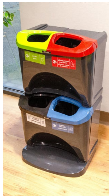
Nexus® Stack Recycling Bin

Maximise the functionality of your office by utilising our collection of indoor recycling containers, designed to create an attractive recycling station. These containers serve as a great tool for boosting recycling rates and minimising contamination within your company.