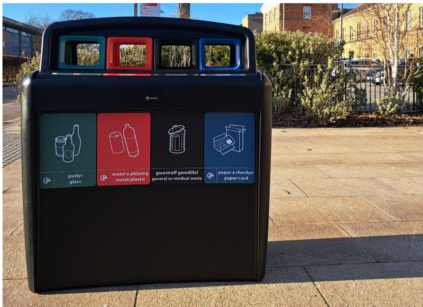
Nexus® Evolution City Quad Recycling Station