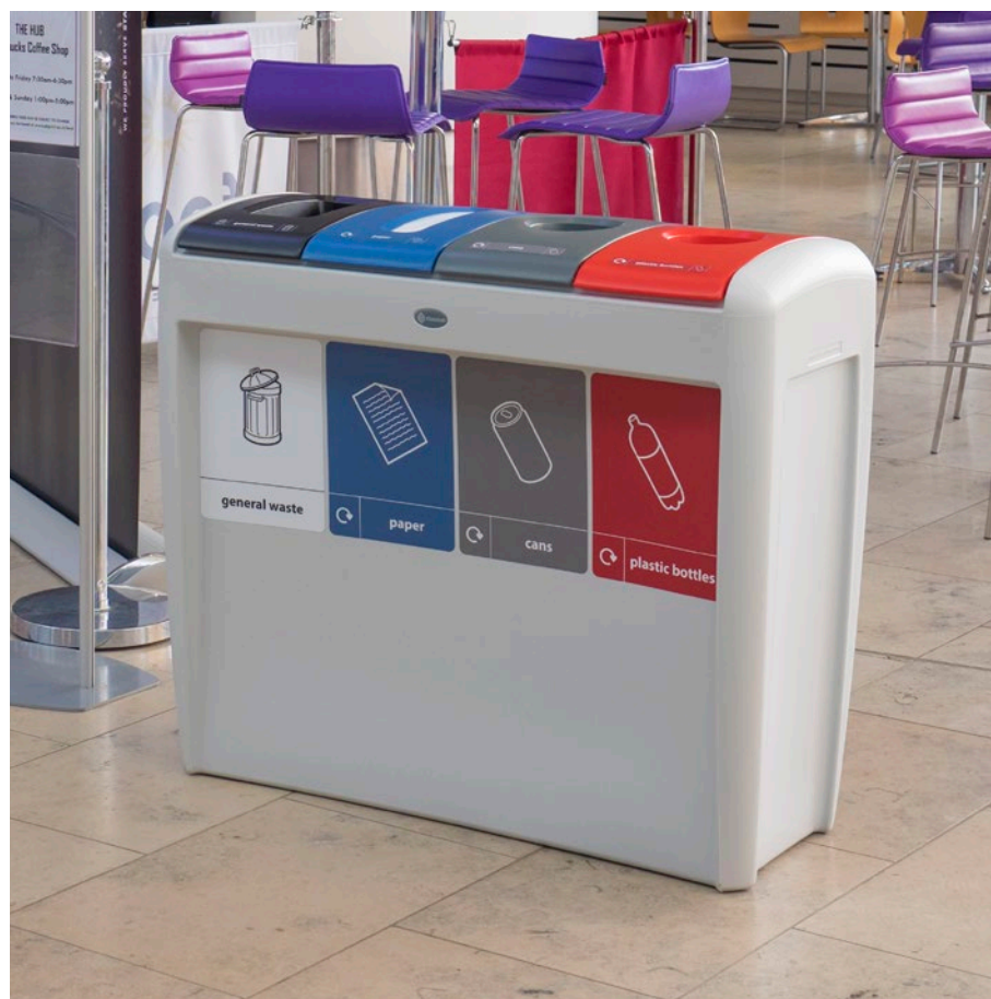
Nexus® Evolution Quad Recycling Station