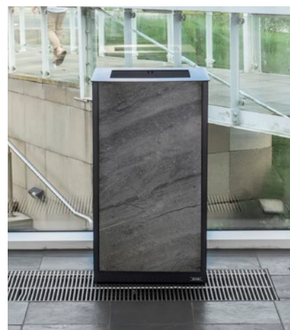
Nexus® Style Recycling Station