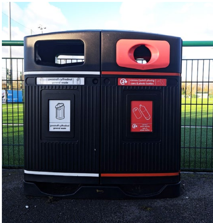
Glasdon Jubilee™ Duo Recycling Bin