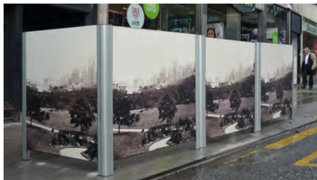
Visage™ Screen System