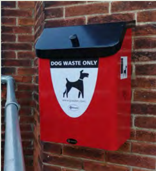
Metal Fido 35™ Dog Waste Bin