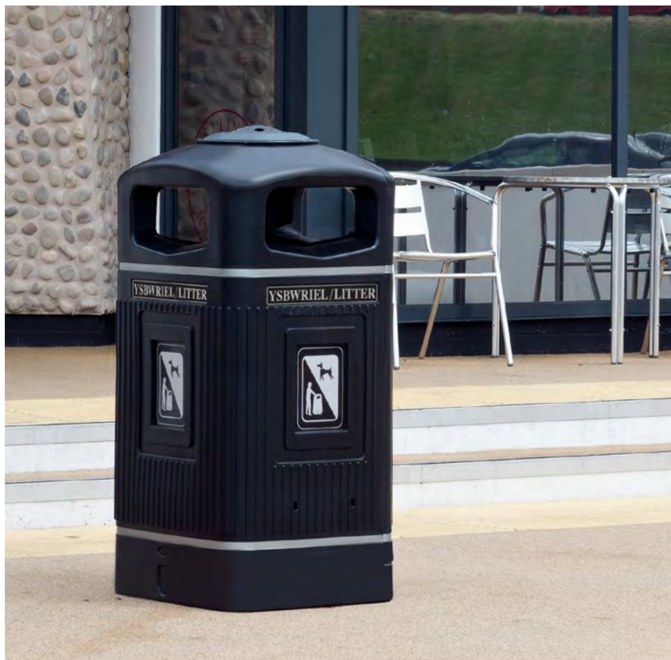
Glasdon Jubilee™ 110 Litter Bin