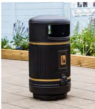
Topsy Royale™ Litter Bin