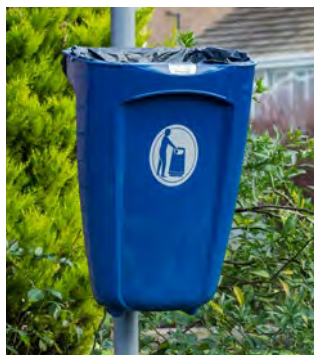
Super Trimline 50™ Litter Bin