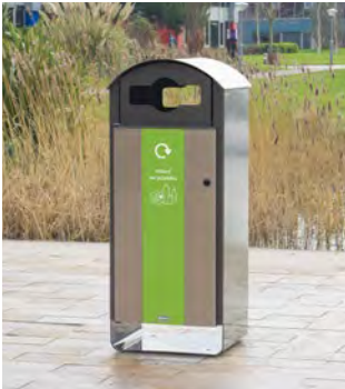
Electra™ Curve 85 Recycling Bin