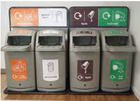
Combo™ Tray Shelf Catering Waste Bin