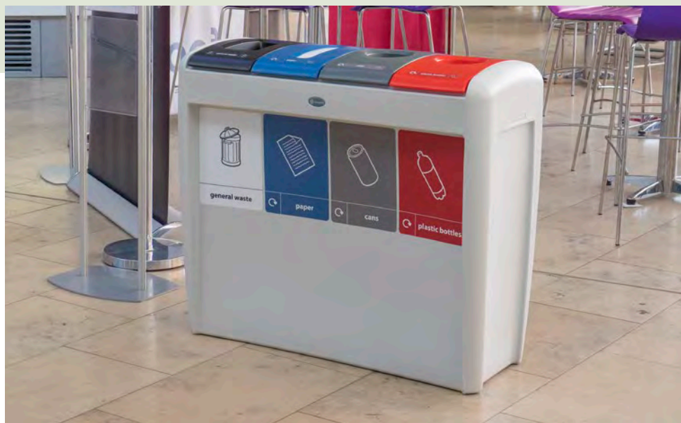
Nexus® Evolution Quad Recycling Bin

Boost recycling rates with Glasdon internal recycling bins. With a variety of attractive styles and manufactured with high quality materials, we can help you create an effective recycling programme for your environment. Apertures and graphics are available for various waste streams, allowing you to manage recycling waste more effectively.