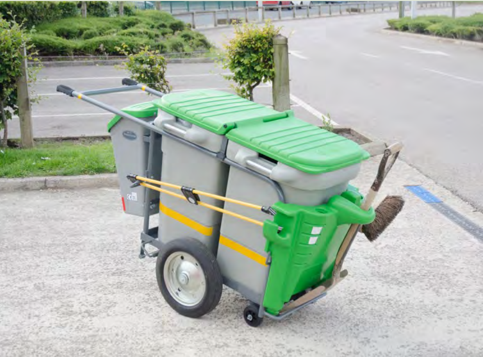
Space-Liner™ Orderly Barrow (Double Model)

We produce a range of litter collection tools, ideal for keeping your environment litter free. Our Orderly Barrows can be used for litter collection and segregation of waste or for transporting equipment.