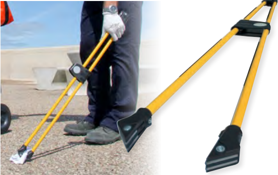
Litta-Pikka™ Collection Tool