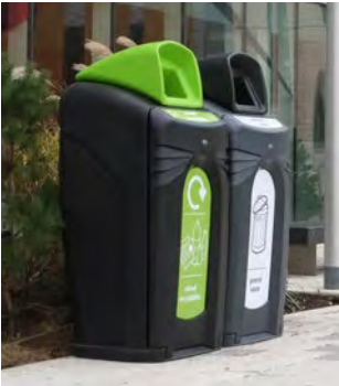
Nexus® City 140 Recycling Bin