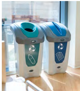
Nexus® 30 Recycling Bin