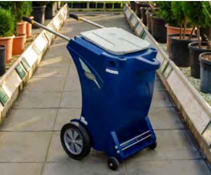
Skipper™ Multi-Purpose Cleaning Trolley