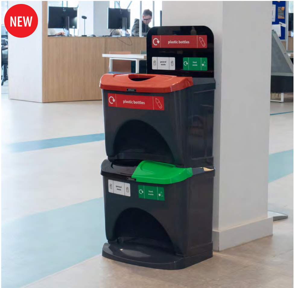
NEW Nexus® Stack Recycling Bins