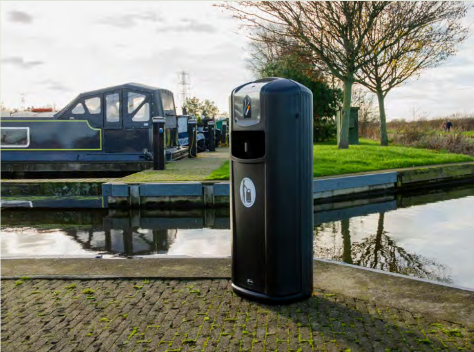
Integro City™ Cigarette & Litter Bin

We're here to help you keep cigarette waste under control on your premises with a wide range of quality, hard-wearing smoking bins. The Glasdon collection offers everything from free-standing ashtrays and cigarette bins to wall-mounted ashtrays.