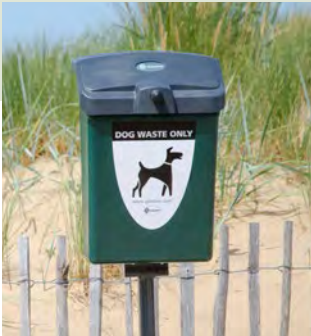
Fido 25™ Dog Waste Bin