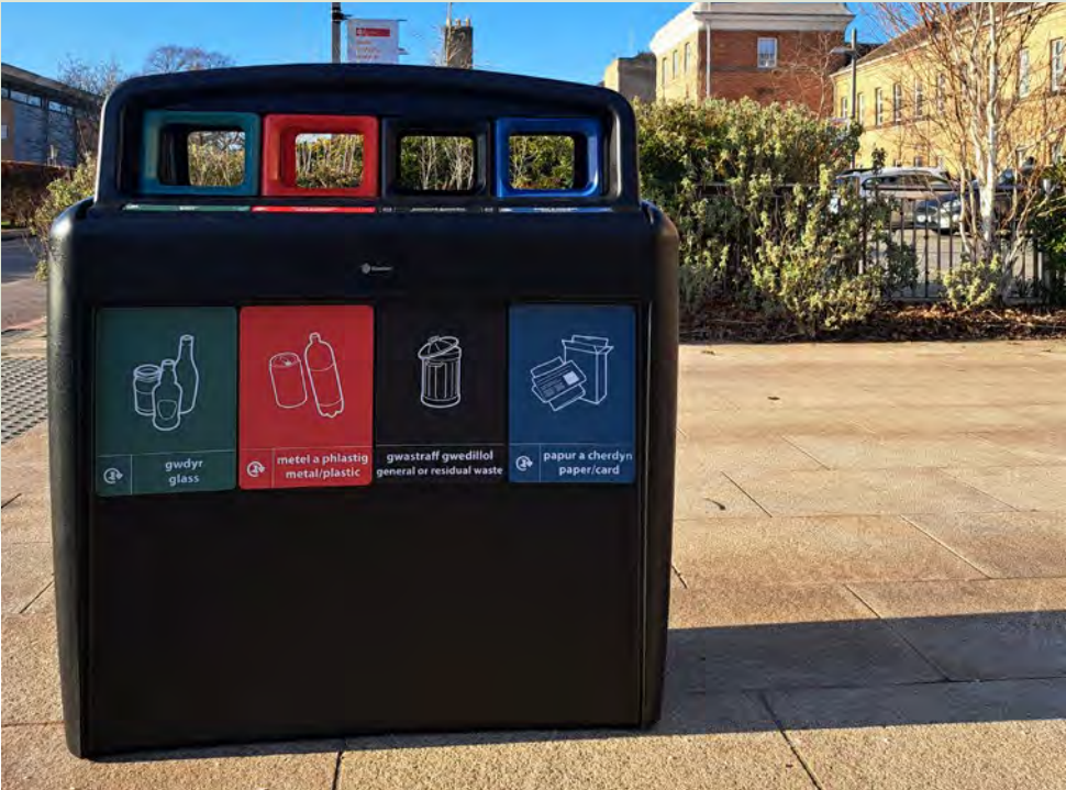
Nexus® Evolution City Quad Recycling Bin

We produce an extensive range of outdoor recycling bins of the highest quality in both traditional and contemporary designs. All of our recycling containers are designed to be hard-wearing and long-lasting and feature easily identifiable graphics to make recycling easy.