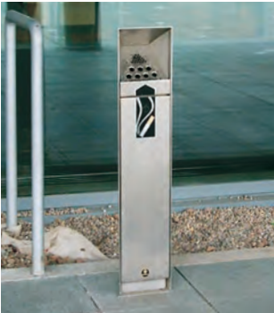
Ashguard™ Cigarette Bin