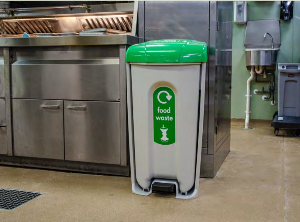
Nexus® Shuttle Food Waste Bin

Our food waste recycling bins are ideal for kitchens, canteens, food courts and any other areas where food is prepared or consumed. The easy-to-use foot pedals and large apertures make food waste disposal effortless and hygienic.