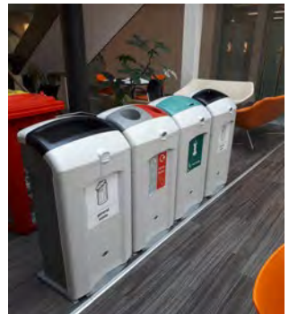
Nexus® 100 Recycling Bin