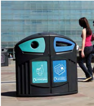
Nexus® 200 Recycling Bin