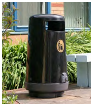
Topsy 2000™ Litter Bin