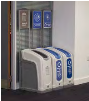
Nexus® 50 Recycling Bin