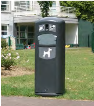
Retriever City™ Dog Waste Bin