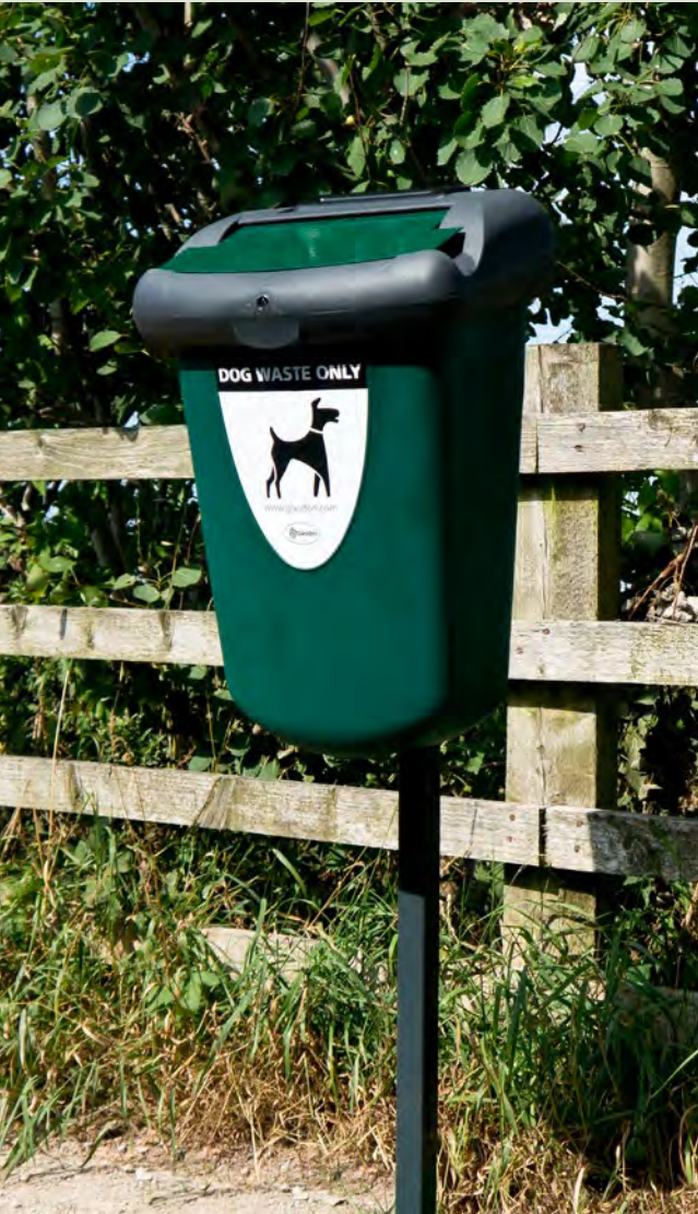
Retriever 35™ Dog Waste Bin

To help keep pavements and open spaces clear of dog fouling, we produce a range of dog waste bins that are extremely strong and durable. Designed to be wall- or post-mounted, these dog waste bins will encourage owners to tidy up after their dogs, keeping areas clean and tidy.