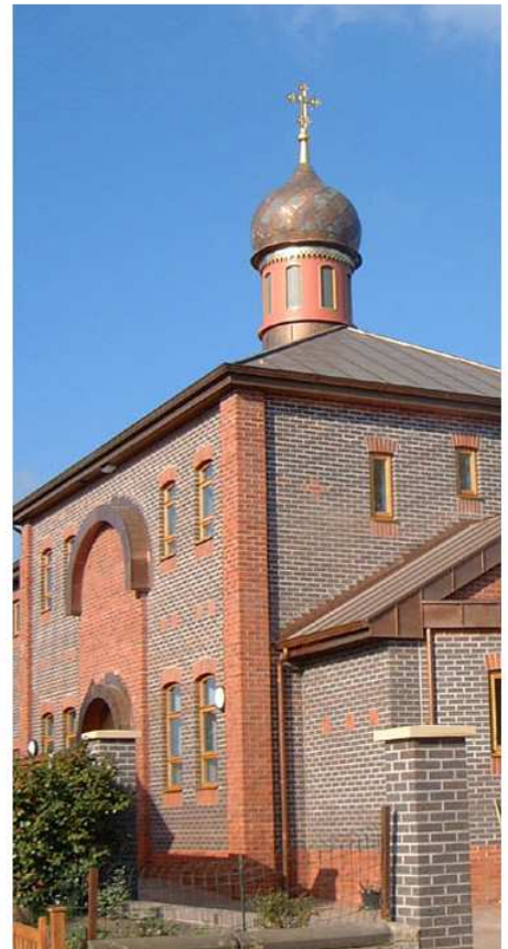
Manchester - Pokrov Church GRP turret with a titanium roof. Copper guttering fitted to whole building. Installed by Good Directions Ltd.