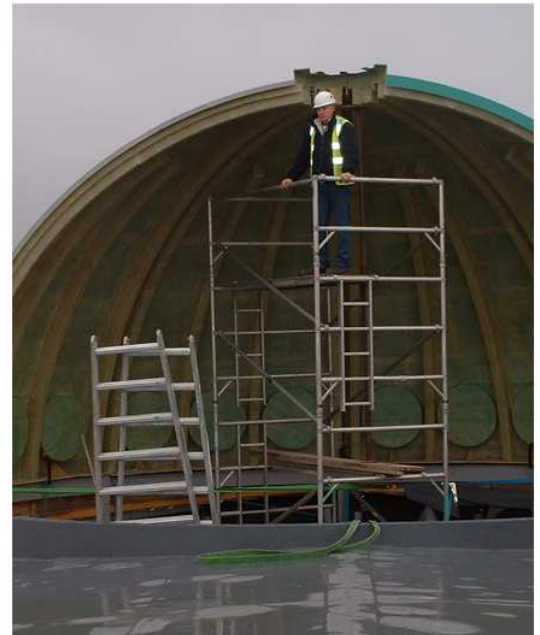
Newcastle - Mosque 8700mm diameter grp dome and a 13200mm minaret. Installed by Good Directions Ltd.