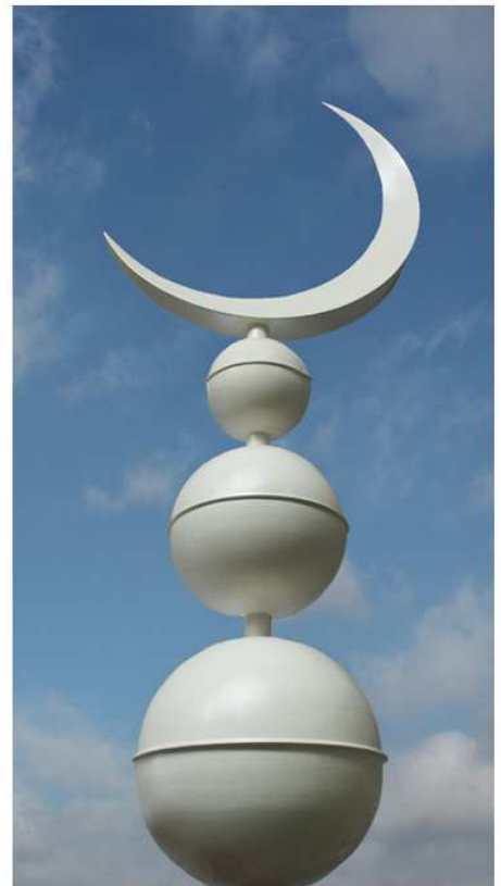
Oxford - Mosque Various grp minarets and painted metal finials. Installed by Good Directions Ltd.