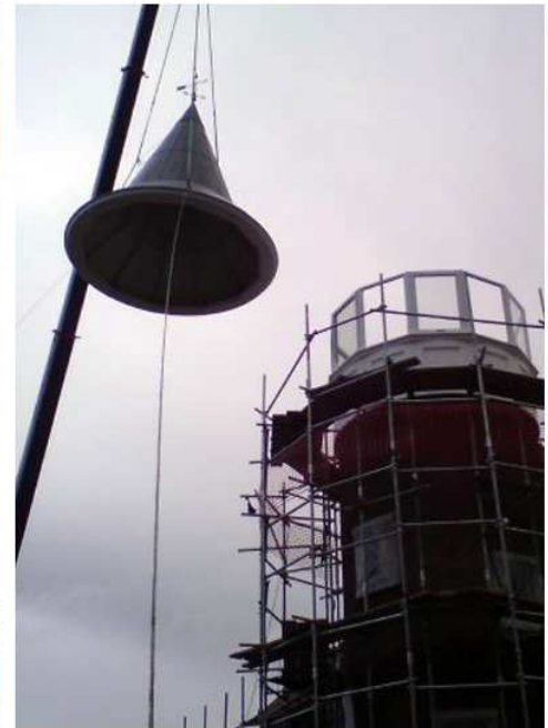
Biscombe Hill House - Private House 3800mm diameter grp and glazed aluminium viewing tower. with insulated internal skin. Installed by Good Directions Ltd.