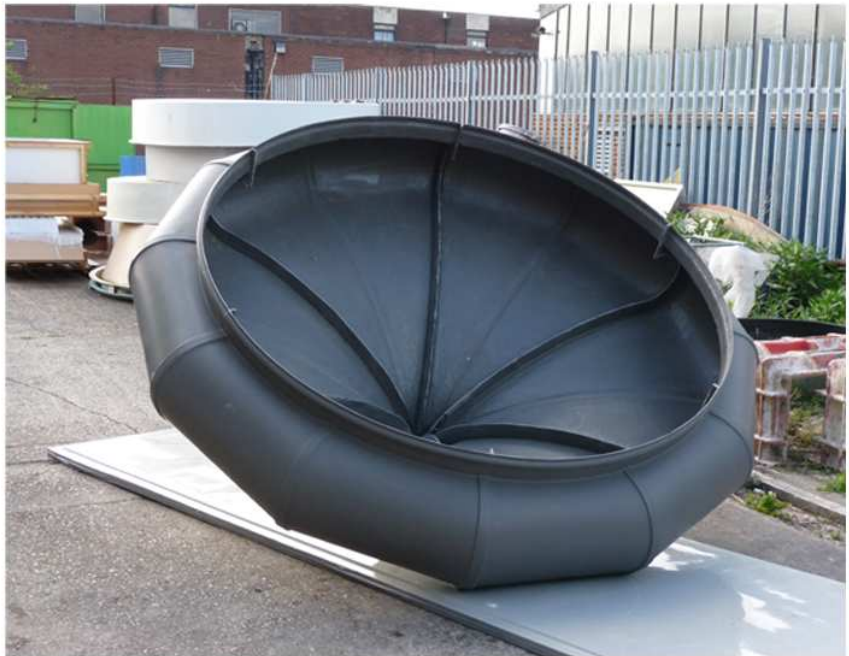
Azerley Chase - Private House 2400mm diameter single skin lead effect roof.