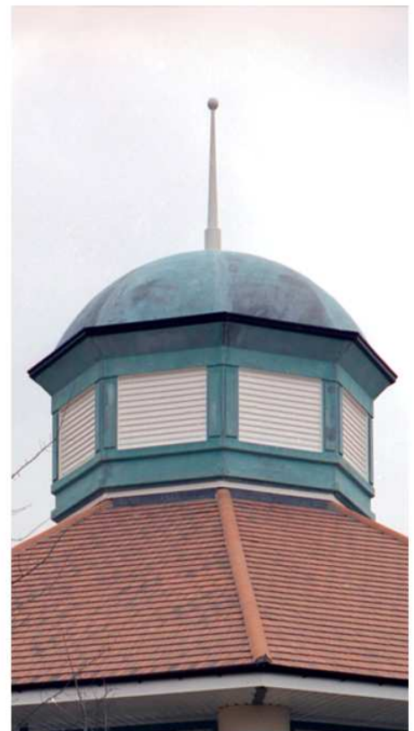
Braintree Shopping Village 5500mm verdigris copper effect dome and turret with a bespoke finial. Installed by Good Directions Ltd.