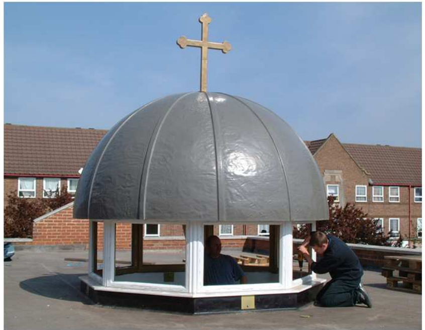
Corby- Serbian Ordothox Church 2no 2400mm diameter grp domes with aluminium glazed turrets. Installed by Good Directions Ltd.