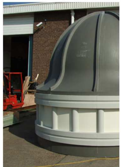
Deiniol Centre - Bangor 3700mm lead effect dome and multi coloured turret fitted with a bespoke weathervane. Installed by Good Directions Ltd.