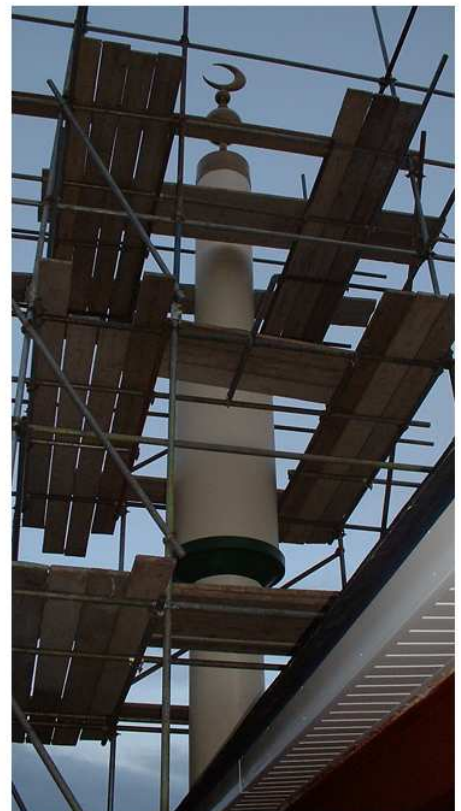
Newport - Jamia Mosque 6000mm diameter grp dome with insulation and internal skin and an 8000mm high grp minaret. Installed by Good Directions Ltd.