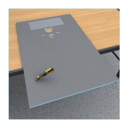
Cut precisely to size...

The fully prepared solution for cladding WC dry wall installations. The wedi I-Board is suitable for large-format tiling, whilst the wedi I-Board Plus, thanks to a pre-integrated reinforcement plate, can be plastered or tiled with mosaic from 2 x 2 cm.