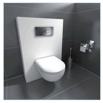
...plaster or tile, done!