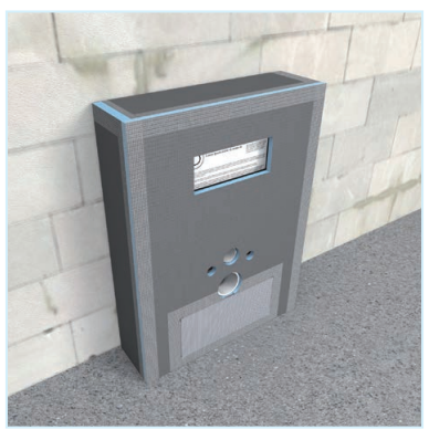
...screw or bond and reinforce...