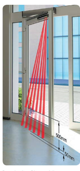
Detection Area Distance Adjustment