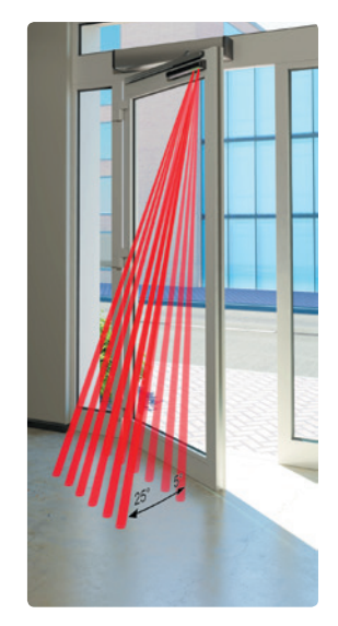
Detection Area Angle Adjustment