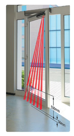
Detection Area Distance Adjustment