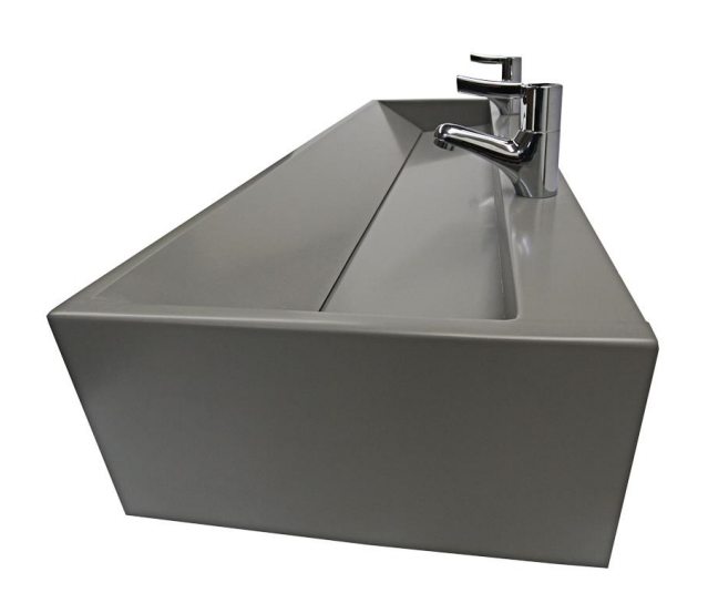
Grey with optional lever operated taps