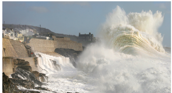
Intercrete 4802 can be easily applied to both horizontal and vertical surfaces

Problem: Jetties, harbours and sea walls can erode from the continual onslaught of waves and waterborne shingle. Stone and concrete structures require superior pointing and bedding to ensure long term structural integrity.