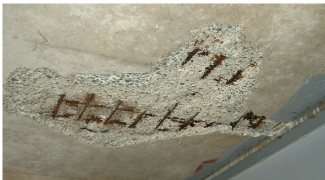
Intercrete products are non-hazardous and completely safe to apply

Problem: Corrosion of steel reinforcement and the subsequent spalling of concrete can occur in splash zones due to continual wetting and drying of surfaces and the action of salt spray.