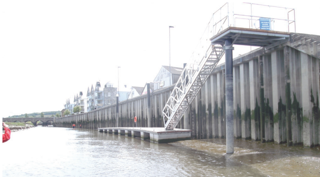
With Intercrete 4840, only UHP cleaning techniques are required

Problem: Steel and reinforced concrete structures require protection from the corrosive effects of chlorides found in seawater. Any coatings used must be applied in wet environments with less than ideal surface preparation.