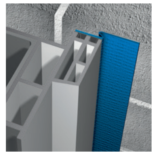
SK alternating self-adhesive for bonding to fram

The details and information given in this literature are based on best current knowledge. They are intended to serve as general information only and it is advised that the user conducts their own tests for their specific set of conditions to determine the suitability of the product for its proposed use. No warranty or liability is given or implied regarding any part of these instructions or details, or the completeness of the information. We reserve the right to modify, or change, the specifications and information without advance notification. All goods are supplied subject to our standard conditions of sales, copies of which are available upon request.