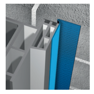
SK one-sided self-adhesive for bonding to frames