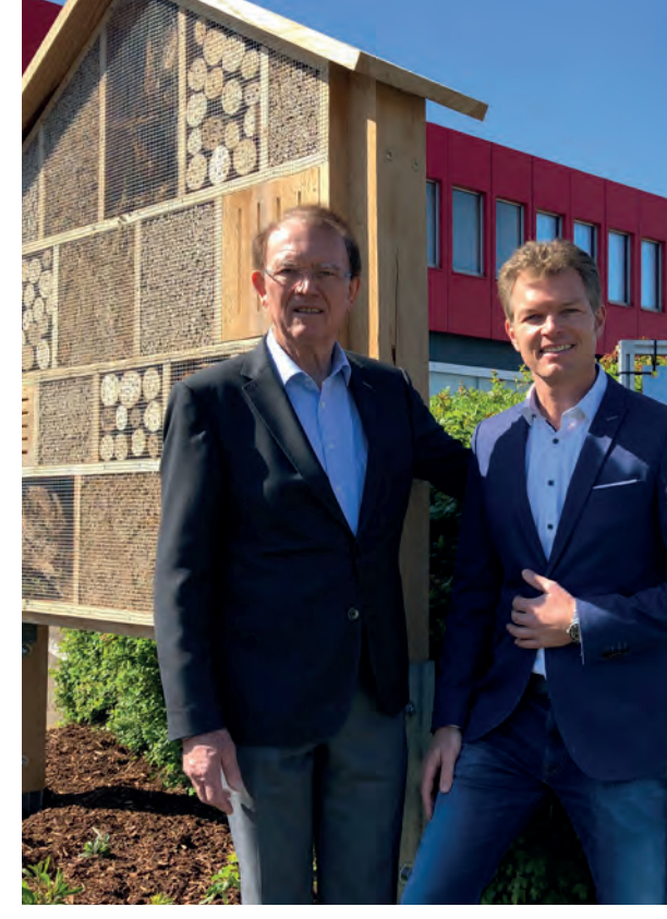
Our Managing Directors at the inauguration of our insect hotel